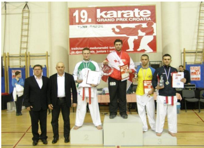
FOTO : GRAND PRIX 2010, 2011, 2012, 2013, 2014, 2015

Trajanje borbe/ time kumite : učenici/učenice; boys/girls 10-11 (1 min) ml.kadeti/ml.kadetkinje; boys/girls 12-13 (1,5 min)